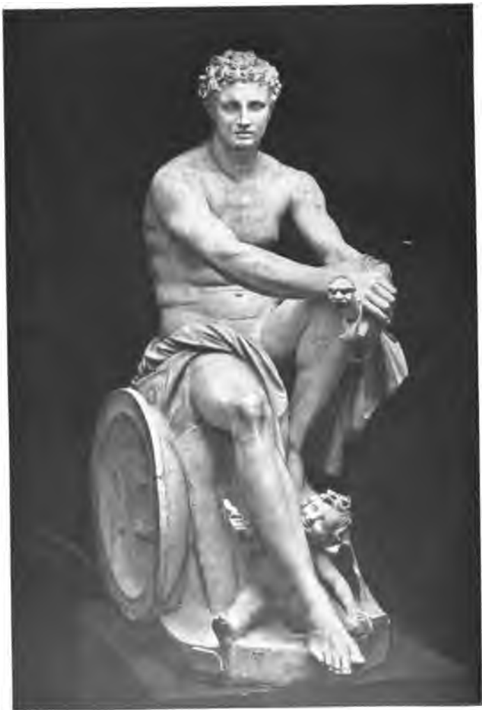
Fig. 28. Ares with Eros.